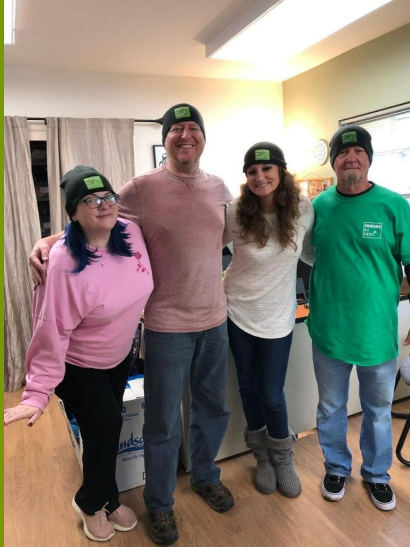
FID staff having fun at the end of last year!