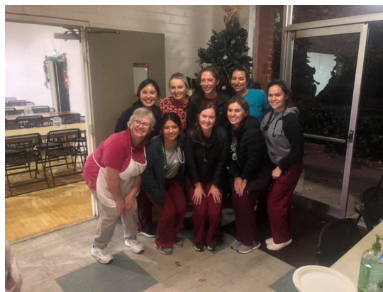
APU nursing students at the Bad Weather Shelter