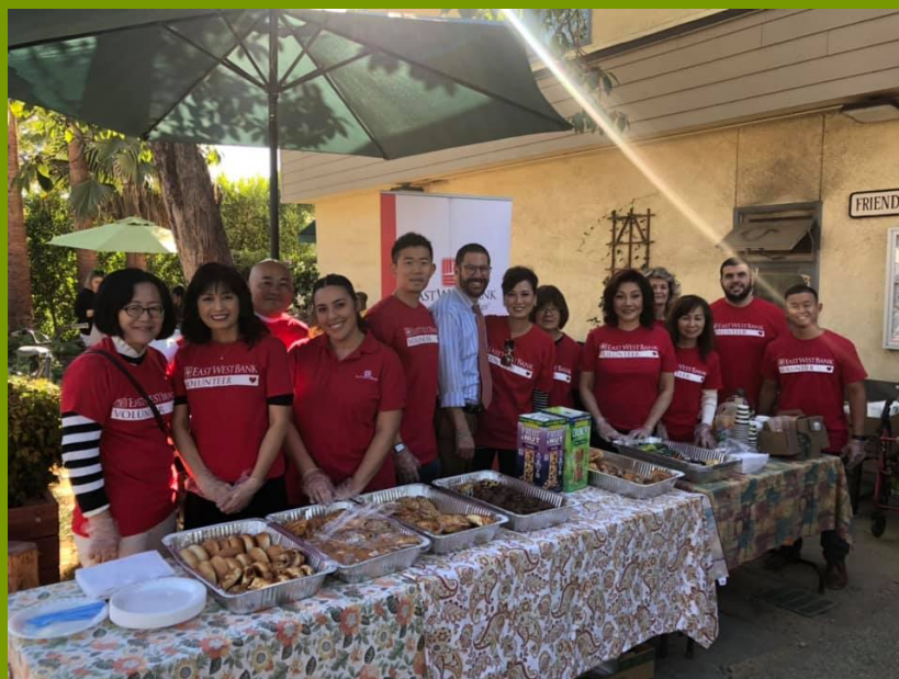
Staff from East West Bank provide "Breakfast Bites" for our Pantry clients (see above for contact details if you are interesting in providing breakfast for our Pantry clients)