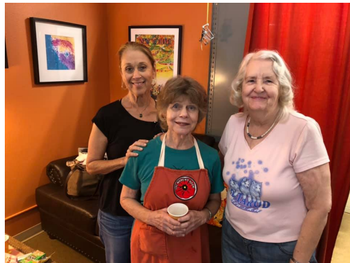
Some of our TWR volunteers