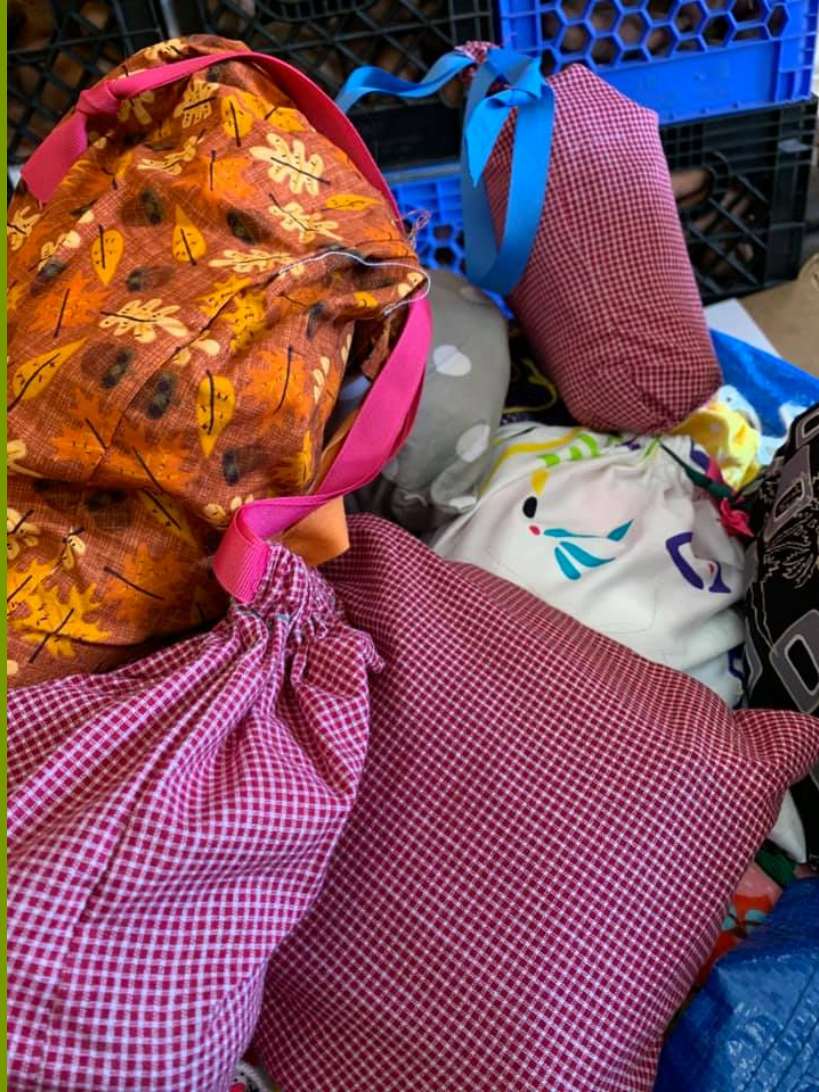
Aria has been sewing and filling these lovely care kits for the ladies in The Women's Room