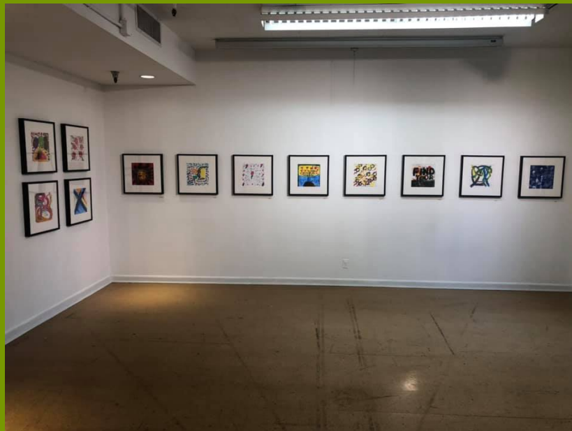
The Women's Room art show at the Armory Center for the Arts