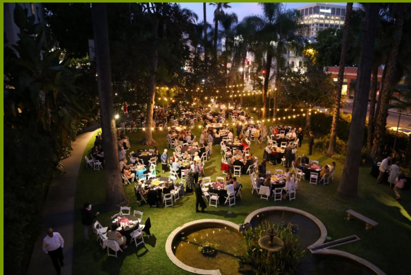
A few more Jazz on the Green photos...