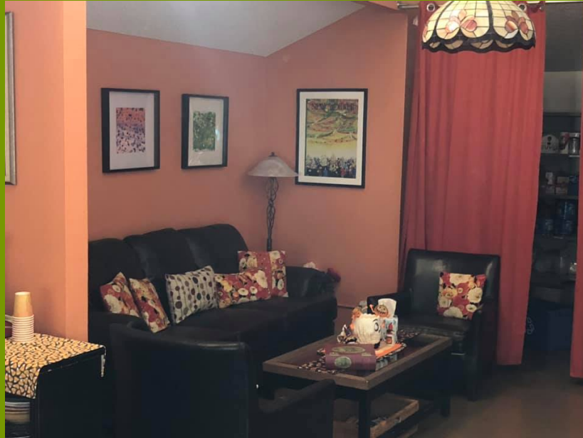
New paint in The Women's Room, courtesy of the Gesner-Johnson Foundation!