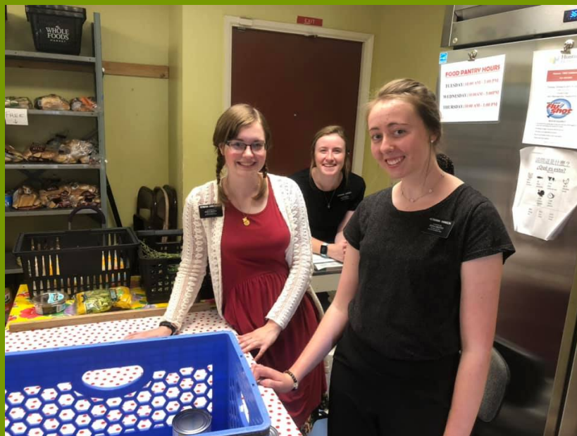
LDS sisters help out in the Food Pantry