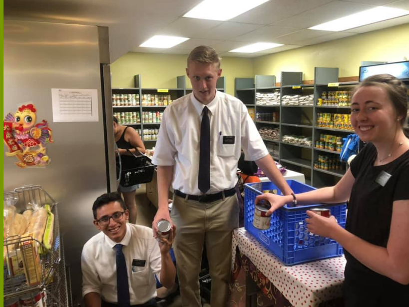
And more LDS missionary friends!