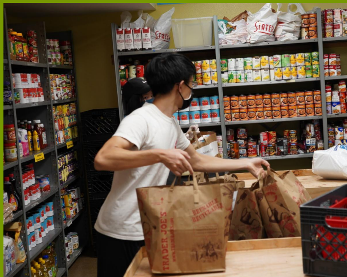
They collected 1,600 lbs of food!