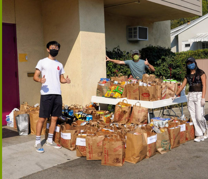
Our thanks to San Marino High School Red Cross Club for running a food drive!