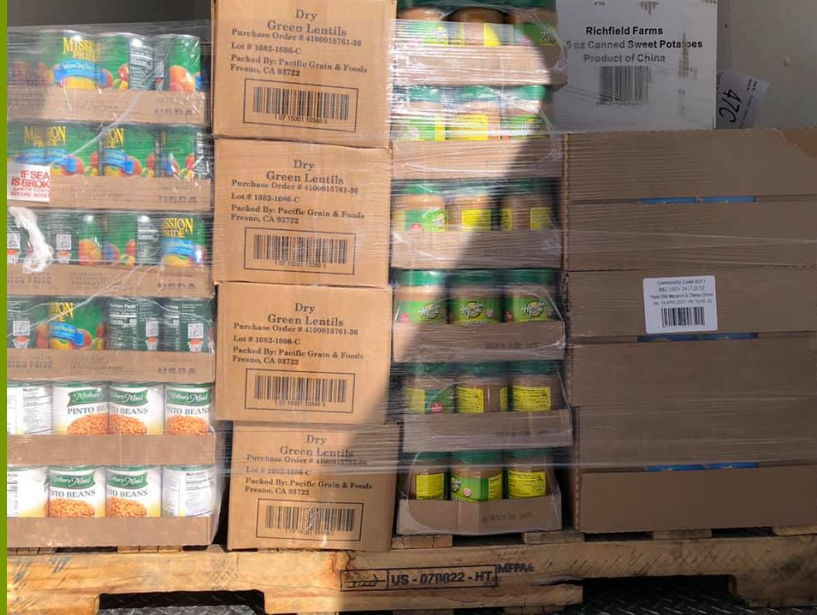
A welcome delivery for the Food Pantry from Los Angeles Regional Food Bank!