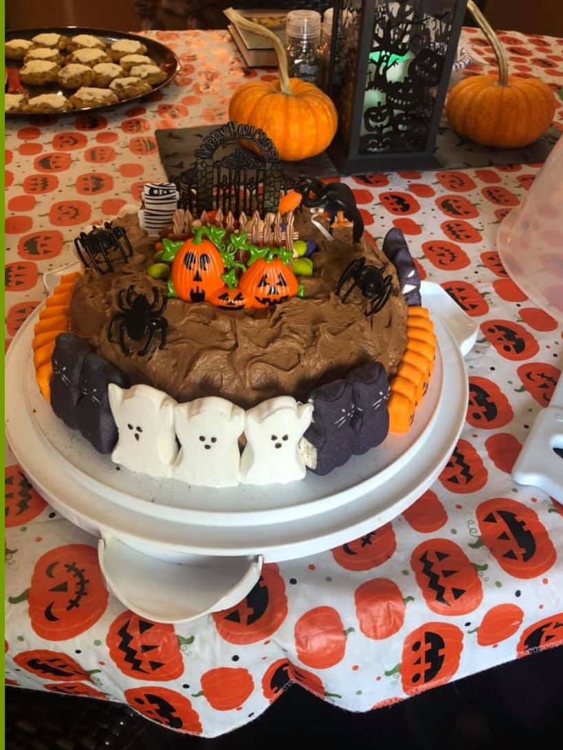
A Halloween cake for The Women's Room