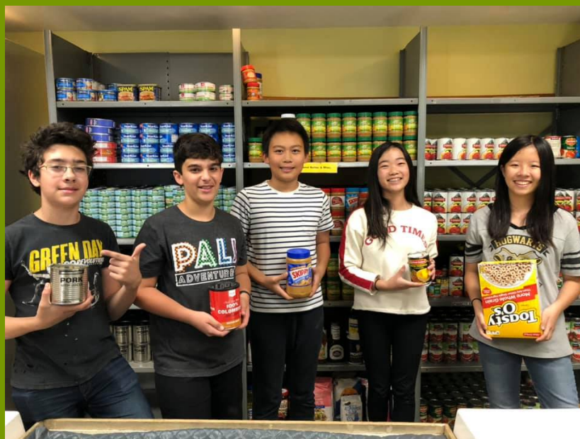
Students from Flintridge Prep help at the Food Pantry