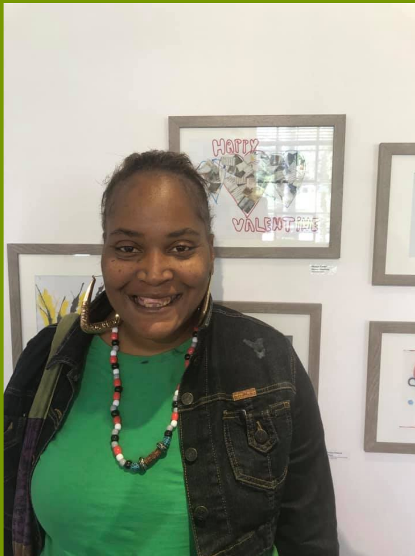
A field trip for the guests of The Women's Room to see their artwork in the exhibition at the Armory Center for the Arts