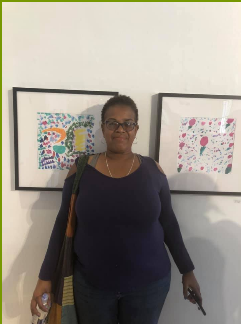
Another TWR artist poses with the paintings