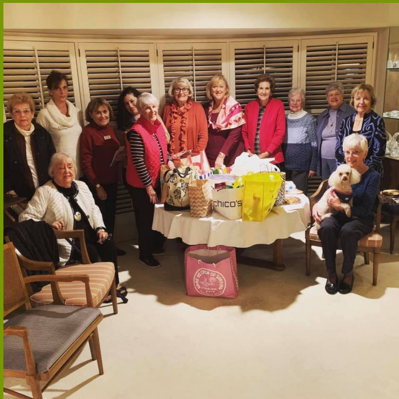
Thank you to the ladies of the SGV Panhellenic Society who collected many bags of toiletries for The Women's Room, and gave a donation too!