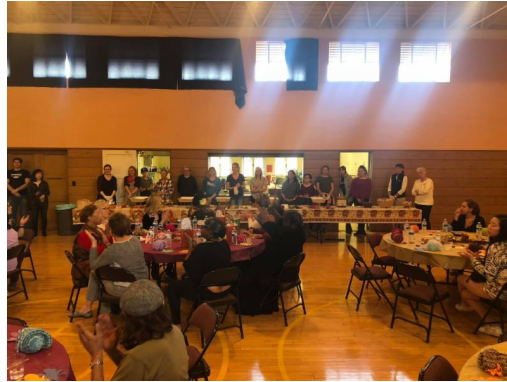
A TWR Thanksgiving feast

this week we had a group in Santa Barbara reach out to us because they had heard from other local agencies that our homeless prevention program is the one to talk to in order to learn how to tackle this problem in their community. I am so very proud of all our staff and am so glad when they have a week like this where successes happen, and people's lives are changed for the better in such a significant way.