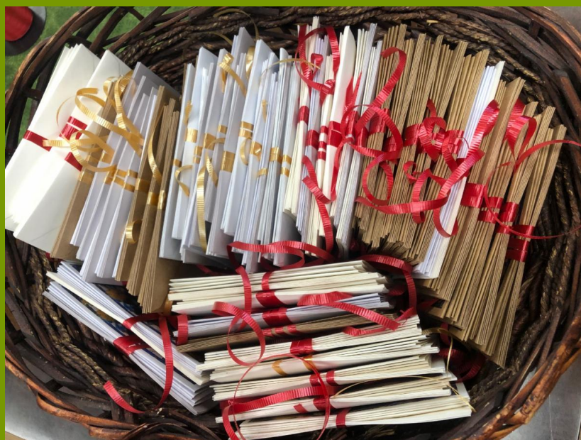
Many thanks to the guests of The Women's Room who helped put together packets of holiday cards in preparation for all the upcoming alternative