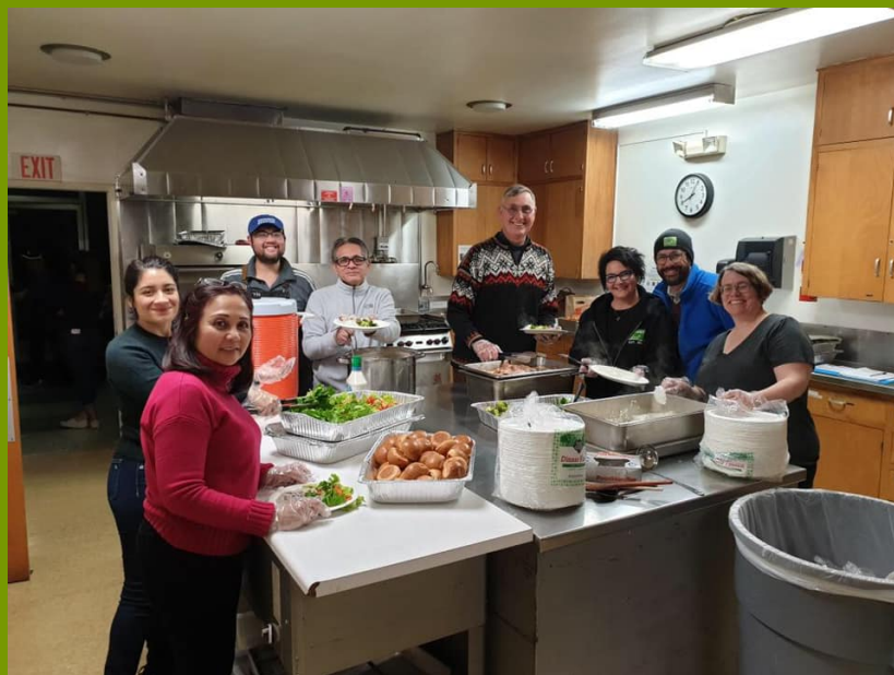
A team effort from FID's board, staff, family, and friends to cook dinner for BWS