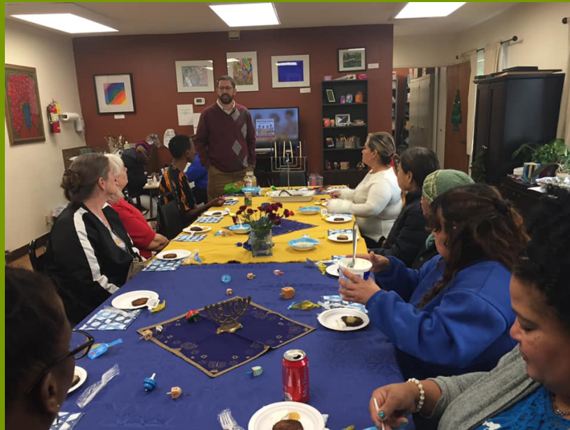
Hannukah celebration at The Women's Room