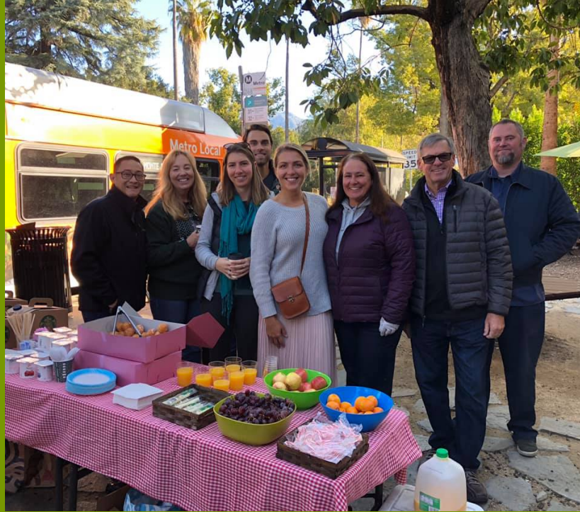
Thanks to Tom Sawyer camps for providing breakfast bites for the Pantry!