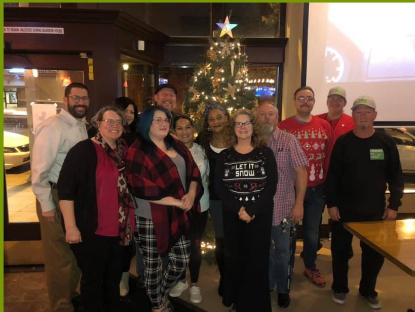
Staff holiday party!