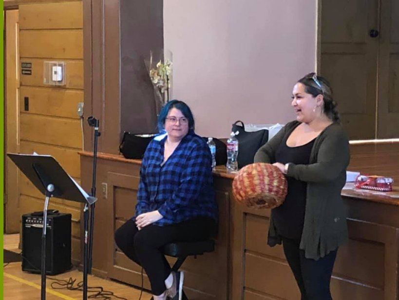
Raffle with exciting prizes!