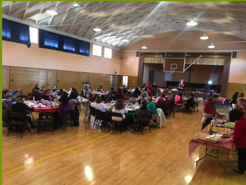
The Women's Room Christmas Party at First Lutheran Church