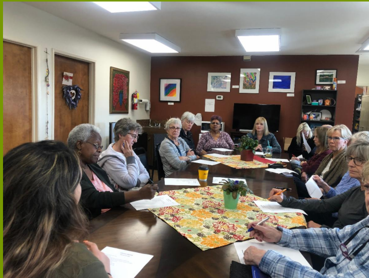
TWR volunteers meeting!