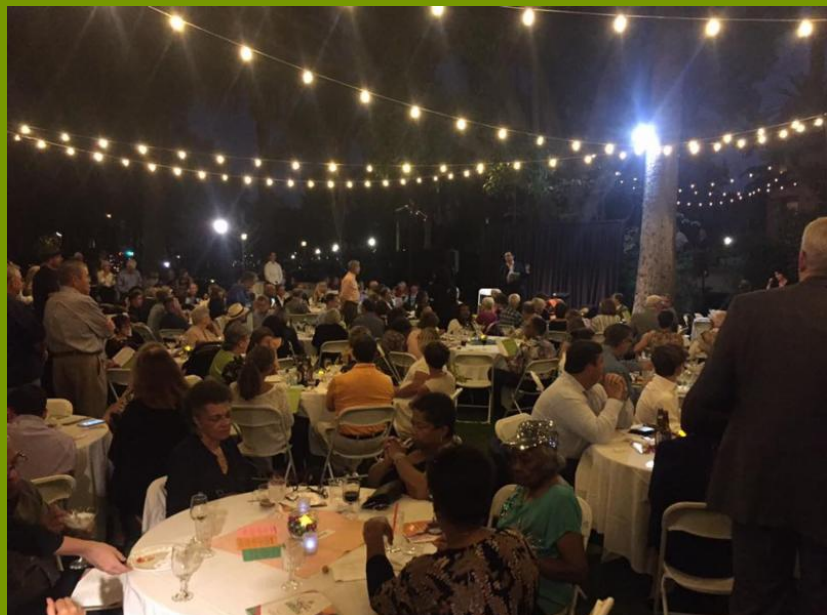
A reminder of what it's like - Jazz on the Green