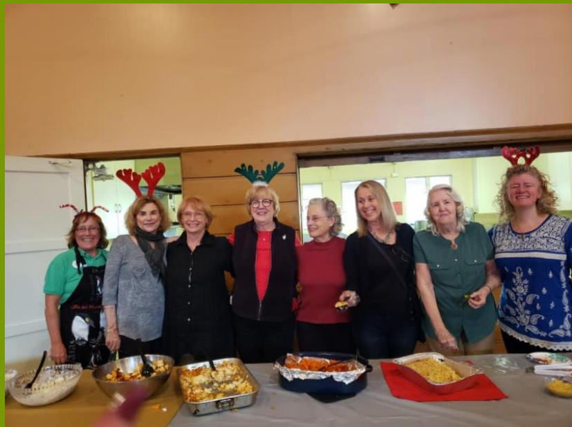
From the archives - members of All Saints Church help with one of our annual Women's Room Christmas parties