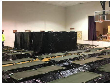
The gym at Pasadena Covenant Church, set up for BWS action!