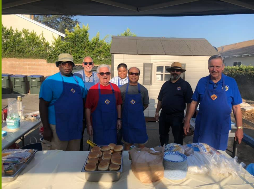
Thanks to the Knights of Columbus for their barbecuing skills!