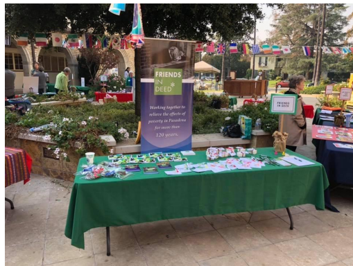
San Marino Community Church Alternative Christmas Market