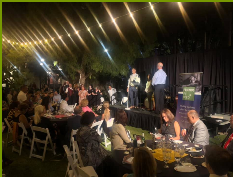
Honoree Pasadena Covenant Church