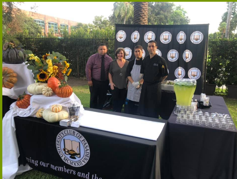
University Club of Pasadena