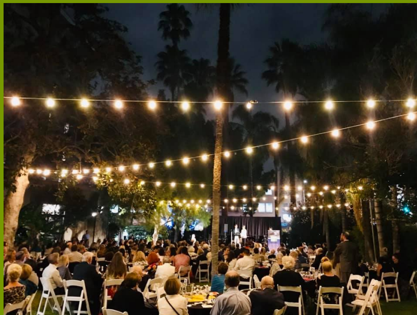
Beautiful Castle Green