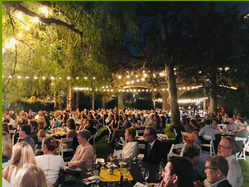
A magical evening under the fairy lights!