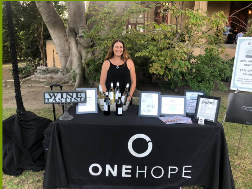
One Hope Wine Tasting