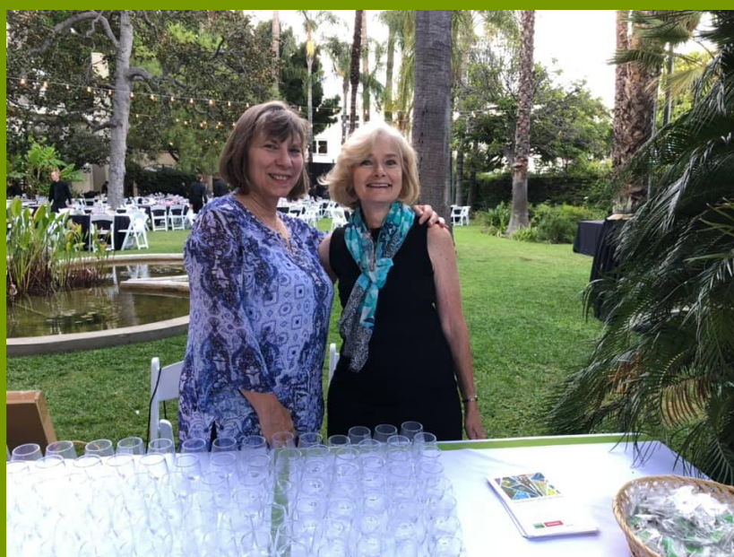
Just two of the many amazing volunteers without whom we could not have done this event!