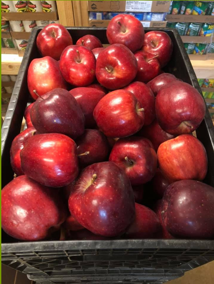
Lots of lovely produce in the pantry this week - apples and (below) cabbages and watermelons