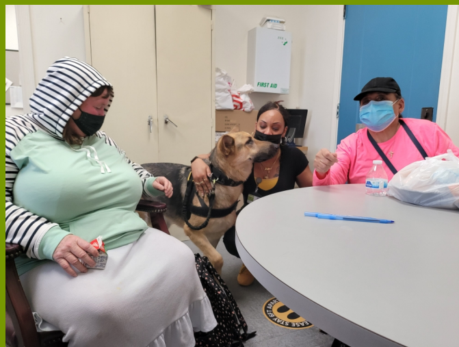
With the help of a furry friend!