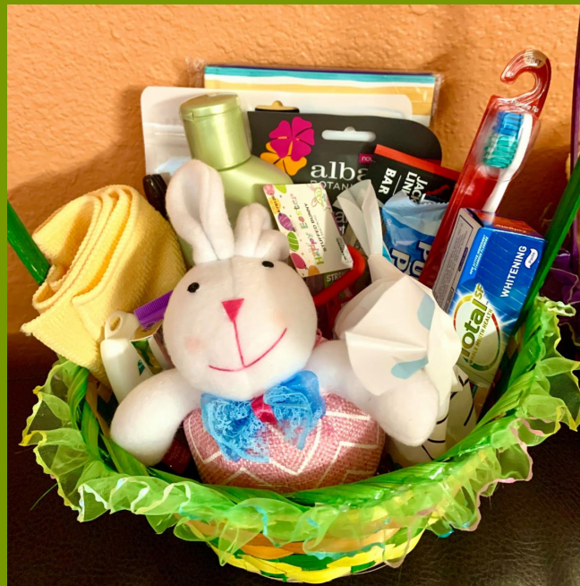
Jayno thoughtfully included an Easter bunny, face masks, tinted lip balms, candy, and other special treats to make our TWR guests feel totally pampered.