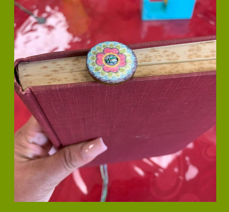
Creativity through arts and crafts with The Women's Room volunteers, Nicole and Brooke, creating bookmarks!