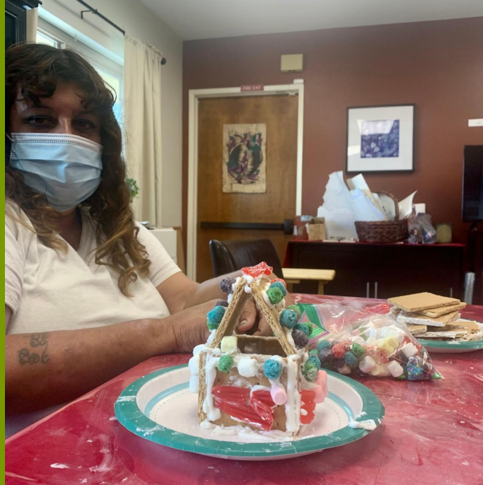
One of our guests with her finished house!