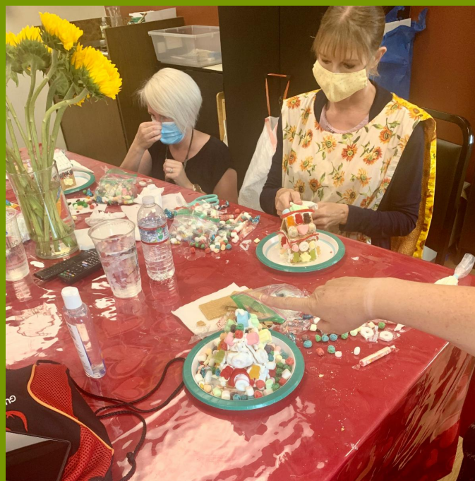
Assembling candy houses in The Women's Room.