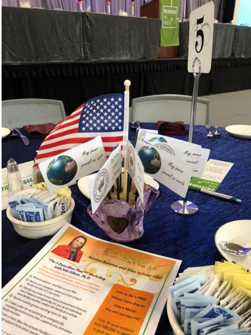
Mayor's Interfaith Prayer Breakfast 2019

We are very excited that the Mayor's Interfaith Prayer Breakfast is next Thursday! If you haven't bought your ticket, table or sponsorship, you only have a few days left. We are expecting nearly 400 people, and we hope you are one of them! All the information can be found here .