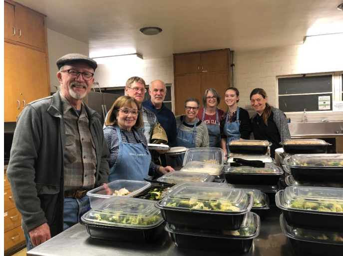
PJTC provides a meal for the Bad Weather Shelter

brought dinner, set up the cots, greeted the clients and spend some time sharing the Jewish values of hesed, compassion, tzedek , justice and righteousness, and kehillah , community. We are very proud to honor Pasadena Jewish Temple and Center!