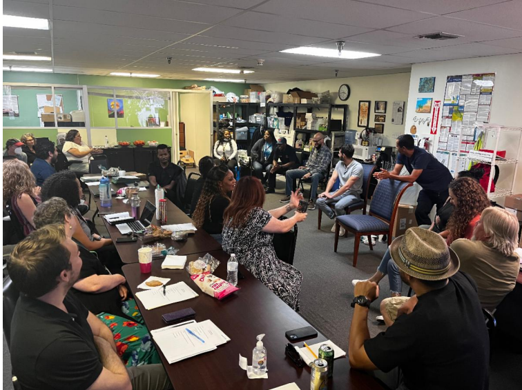
FID staff and the PORT Team

Finally, Sunday night begins Rosh Hashanah, the Jewish New Year. This is a time of introspection, prayer, family, community, and renewal for the Jewish community. From my family to yours, I wish blessings for health, happiness, peace and goodness - for us, our community, our nation and our fragile world. We say Shana Tovah , happy new year!