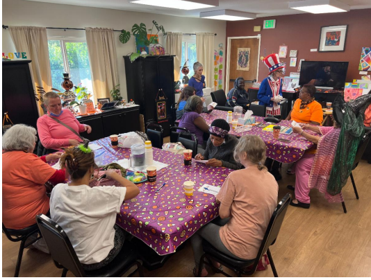
TWR guests and volunteers participating in a festive holiday game.