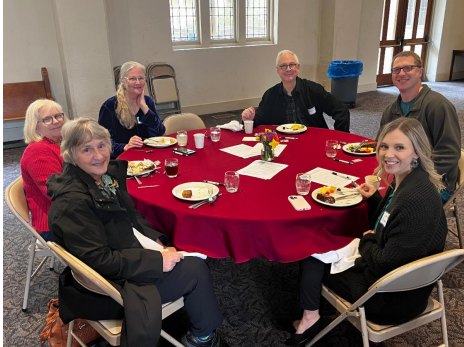
Clergy members visiting at the luncheon.

To learn more about what our Street Outreach program, or any of our programs, offer, visit our website, www.friendsindeedpas.org .