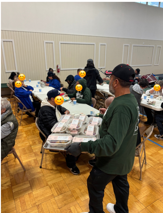
BWS staff members serving dinner.