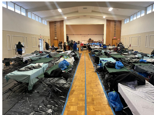
Bad Weather Shelter setup.

While we are very proud of our work with the shelter, something even more special happened during these few days. The thing we pride ourselves on at Friends In Deed, as you all know, is the way in which we treat each person with compassion and dignity, making sure they feel seen and heard and know that we care. So we didn't just have people eat and sleep and stay dry. Our staff screened a movie with popcorn; brought in games, cards, and art supplies; put music on to dance; and improvised a ping-pong table. There were also plenty of people around to talk, offer case management, and just be a listening ear. Our staff showed amazing poise and teamwork, and made Herculean efforts to make this happen. Thank you!!