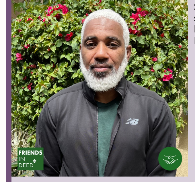
Station Homeless Services, serving people experiencing homelessness in Pasadena...Read more.