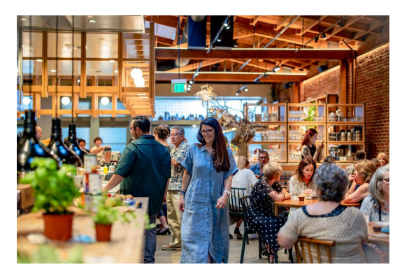
Aspiring chefs cooking in the Agnes kitchen